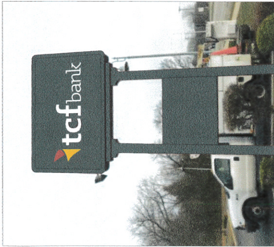
PROPOSED SCALE: N.T.S.

NOTE: REMOVE AND DISPOSE OF EXISTING FACES