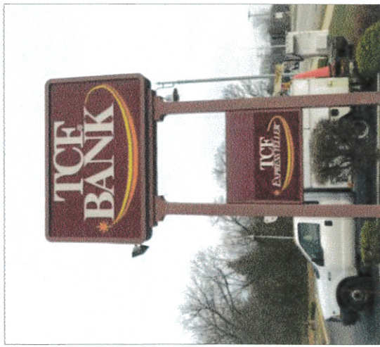
EXISTING SCALE: N.T.S.

SQUARE FOOTAGE TOP CABINET: 85.37 SQUARE FOOTAGE LOWER CABINET: 26.25 SQUARE FOOTAGE TOTAL: 113.62