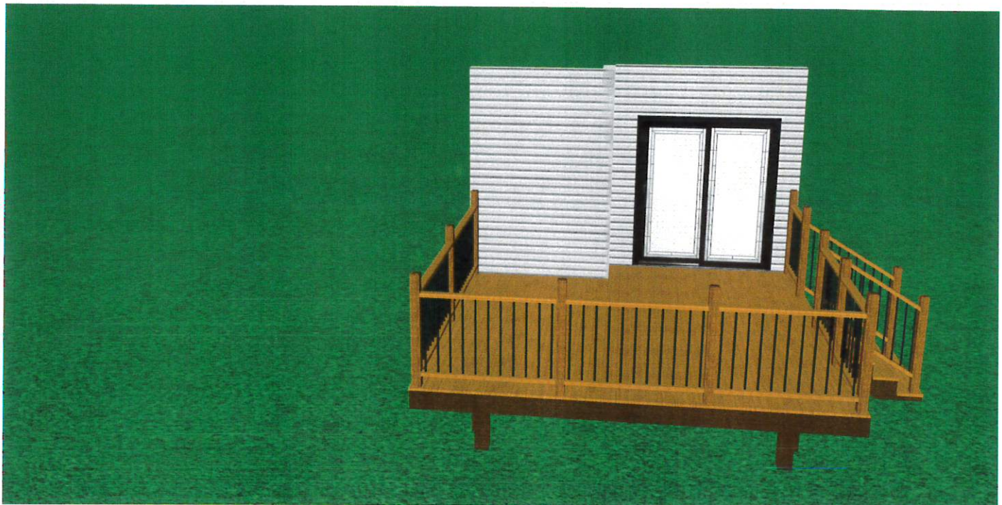
Illustration intended to show general deck size and shape. Some options may not be shown for picture clarity.