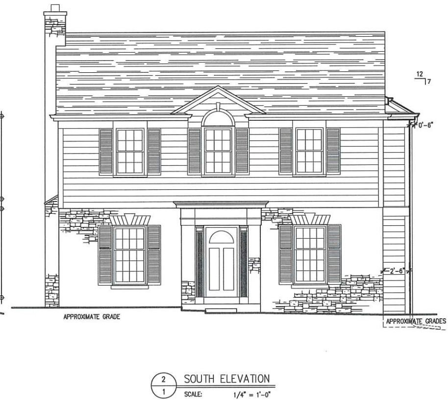
2 SOUTH ELEVATION 1 SCALE: 1/4" = 1'-0"