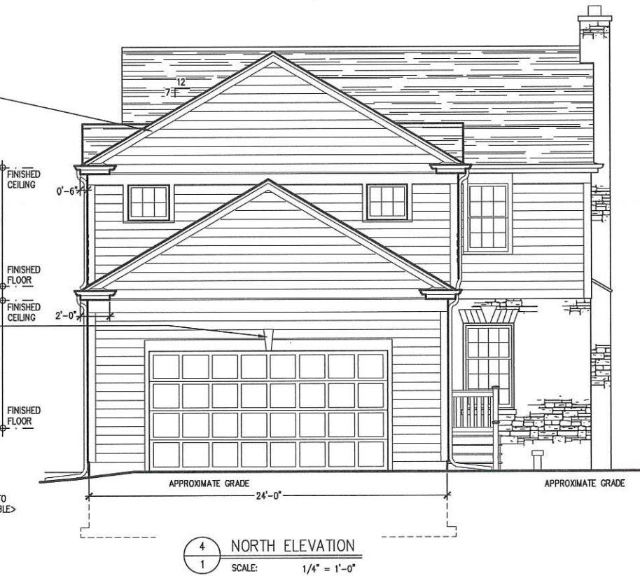
4 NORTH ELEVATION 1 SCALE: 1/4" = 1'-0"