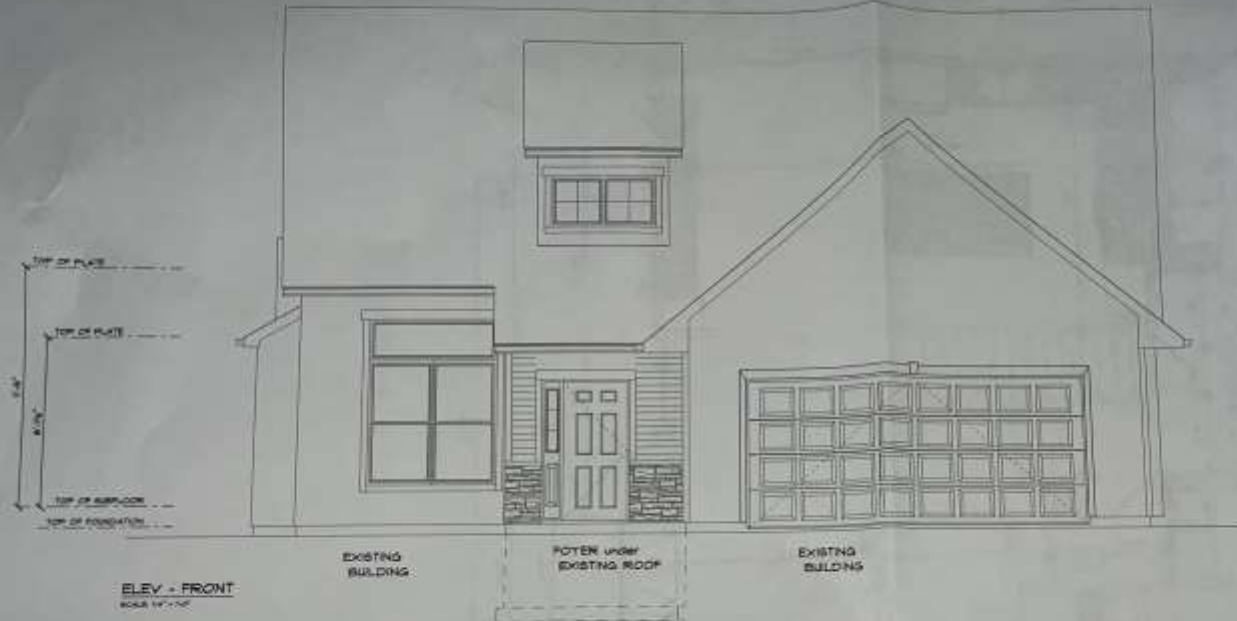
ELEV - FRONT SCALE 1/4" = 1'-0"