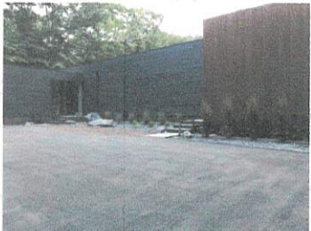
WAX POLY GRAVEL