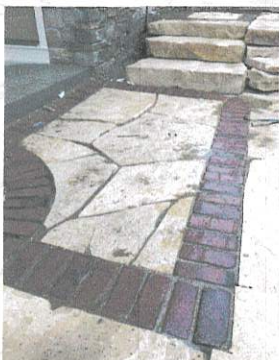
RECLAIMED PAVERS WITH FLAGSTONE INLAY

DOWNSPOUT/RAIN CHAIN DISCHARGE INTO WATER FEATURE - TBD WITH AQUATICA