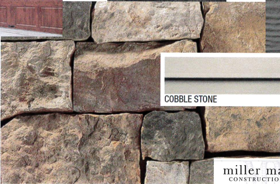
CUMBERLAND – EXTERIOR MASONRY